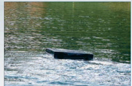
Efficiently eliminate stagnant water

Kasco De-icers are effective in either mild or severe winter climates. In milder climates fewer Kasco units are required for safe de-icing. Users find that Kasco De-icers create more water flow than any product available.