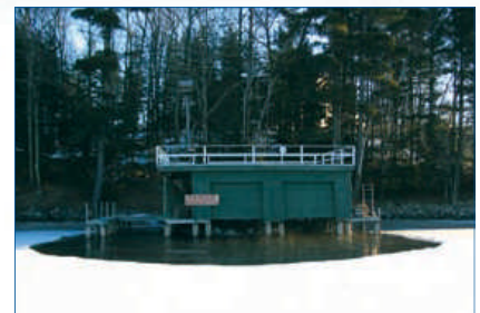
Prevent winter kill and protect structures from ice damage